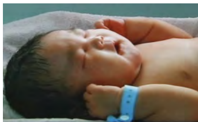
Fig.2. Tag on Infant's Hand

In general in India and other third world countries with a poor economy the maternity ward in hospitals have a major disadvantage, these hospitals do not have enough resources to provide a room for every infant after its birth and hence as soon as an infant is born it is taken to a common room and kept along with several other infants. There arises a case of confusion at times. The nurses in these hospitals to keep track of the children follow some vague methods such as tying different colour threads to the hands of the children as shown In fig 2 Various Government hospital have the tendency to allocate tags for new born babies and keep them in general wards as shown in fig 2. This may lead to abduction or exchanging of individual infants.