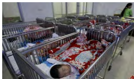
Fig.3. General Infant's ward of Government Hospital

Tagging babies is an elusive method followed in many hospitals since its is easily managed and less time consuming. In some worst cases this may lead to exchanging of babies and the parents might not be aware of it until the DNA test is been taken. It may lead to family disputes in case of further investigation regarding the personal DNA test in future. For this reason each individual baby footprint is separately taken as personal identity so that its stored in the database from which we can recognize the baby easily. In this case fingerprint cannot be opted whereas all the just born palm will be shrunk. Allocating babies individual rooms is very difficult so in order to manage it in groups high authentication should be implied.